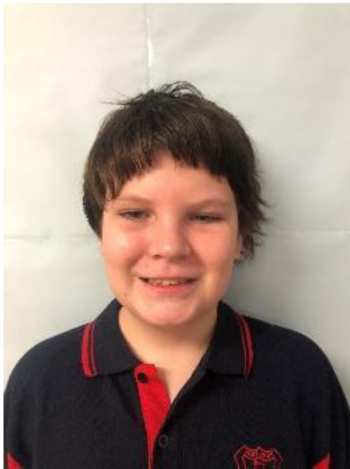
Consistent classroom engagement