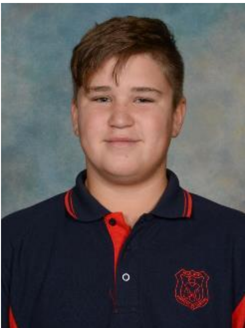
Enthusiastic attitude and great work in Technology Mandatory Engineering