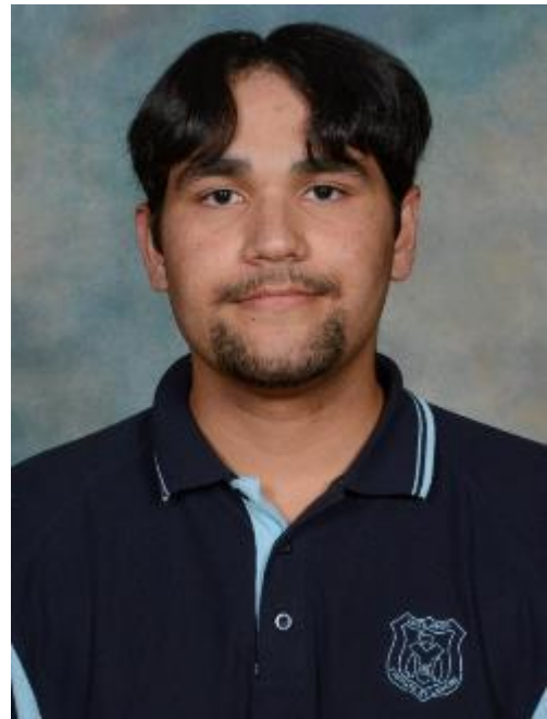
Improving academically this term