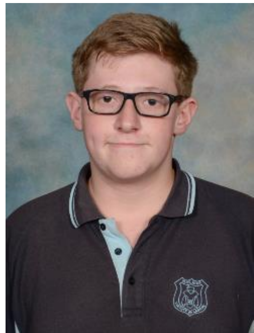
Always working positively