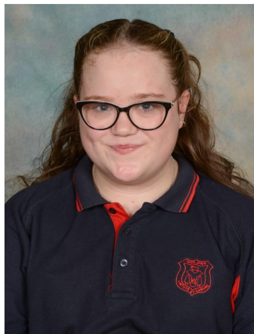
Resilience and positive attitude towards school