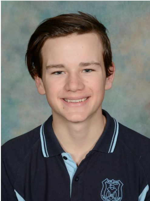
Improved focus and engagement in Mathematics