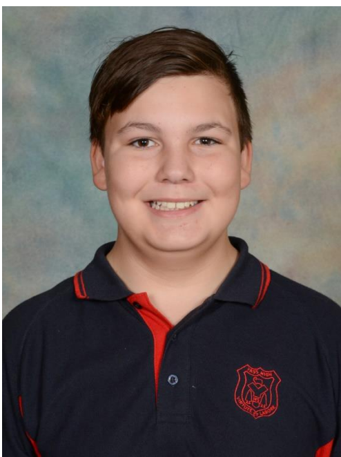
Effort in Language