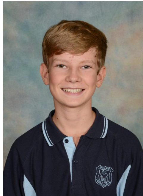
Excellent work and commendable effort in Visual Art and Music