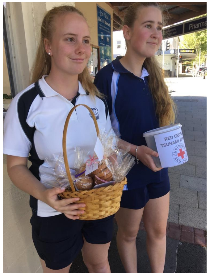
Great work from our students fundraising for the Red Cross Tsunami Appeal.