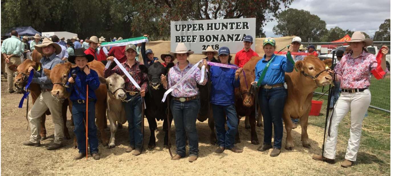
Congratulations to all students involved in the Upper Hunter Beef Bonanza!