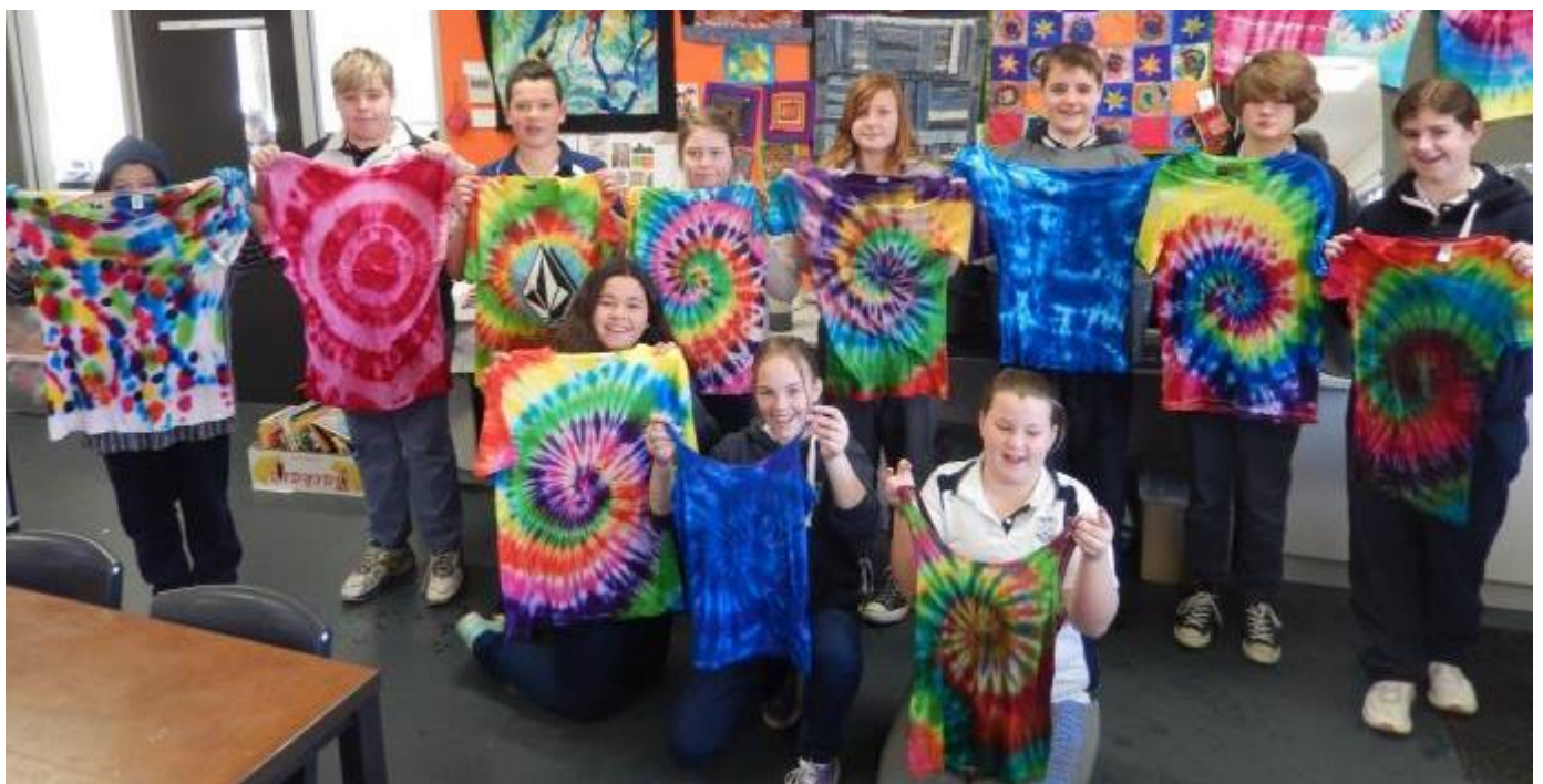
Year 7 with their tie-dyed items