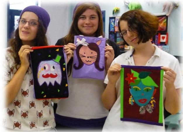
Yr 11's with some fun appliqued hangings – the theme of which was faces.