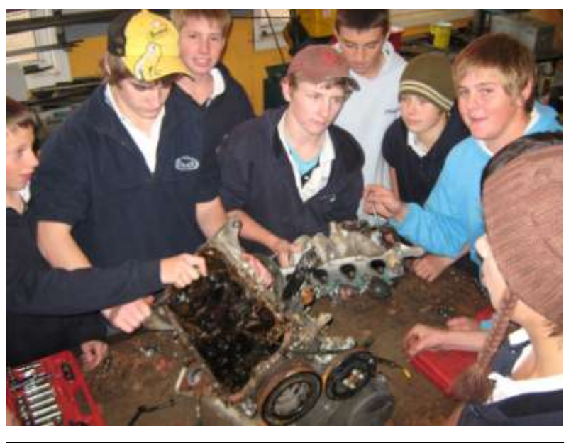
Year 9 students in the process of dismantling a Suzuki motor. This activity certainly made the boys appreciate a range of mechanical skills.

The Year 9/10 Automotive class has acquired a number of engines and carburettors thanks to the generosity of a couple of local firms. These have enabled students to "hands on" valuable gain experience and better appreciate the theory they have "endured". Talking about 4 stroke operation and the way it is achieved is one thing, however, when the motor is dismantled and the working parts are examined, students get a better and longer lasting knowledge of the process.