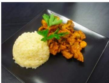
Year 12 Hospitality are using different methods of cookery and have made dishes such as rice paper prawn rolls, coq-au-vin and rice pilaf