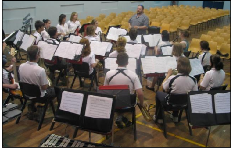
Band members playing their instruments

On the 24th of November the Yass High School Band performed in front of local residents and some of the surrounding primary schools. All day the band members had been practising to perfect their fantastic instrument skills to entertain the audience that was due to arrive after lunch. The reason for the concert was to raise money for Legacy, an organization who helps families of deceased war veterans.