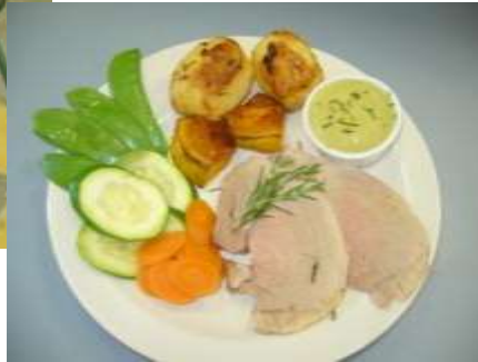
Roast pork and vegetables with apple sauce – ready for Christmas!